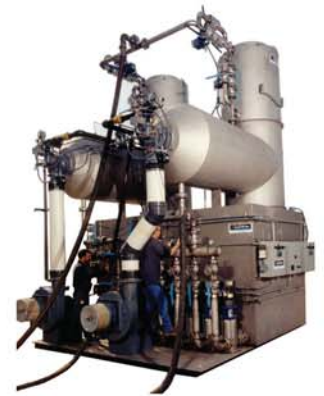
Direct Contact Water Heater

PARAFOS® gamma ensures that scale buildup in the packing area of Direct Fire Water Heaters is reduced or eliminated. Proper water flow through the rings ensures that efficient heat exchange is maintained. Expensive and hazardous cleaning is reduced or eliminated. Ring replacement is avoided and maintenance and downtime is greatly reduced. PARAFOS® gamma helps keep the waterside of steam-to-water Heat Exchangers scale free, ensuring continued efficiency while reducing maintenance and downtime.