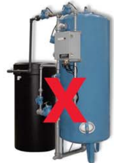
Water Softener System