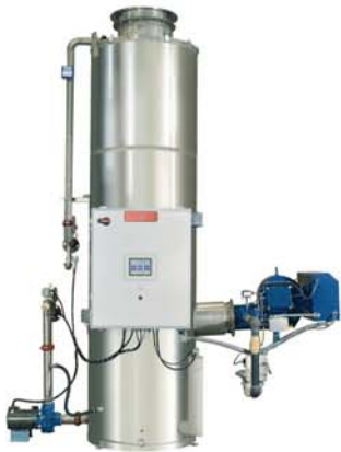
Direct Contact Water Heater

PARAFOS® gamma is specially formulated for use in high temperature water treatment applications. PARAFOS® gamma treats and controls scale deposits in potable water systems where temperatures exceed 160°F. PARAFOS® gamma also provides corrosion control by forming a monomolecular protective film on waterside surfaces. Direct Contact Water Heaters and steam-to-water Heat Exchangers are ideal applications for PARAFOS® gamma.