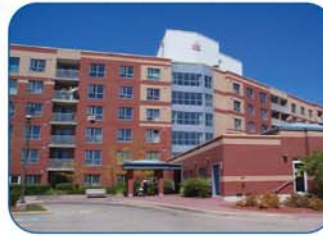
Commercial / Institutional